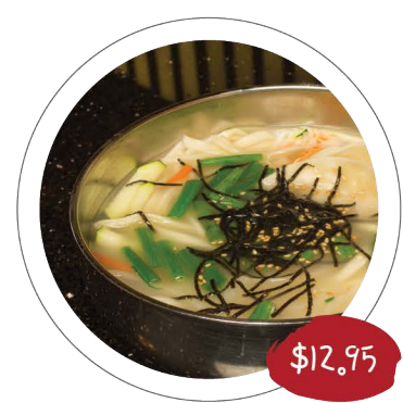
21. Beef Noodle Soup (Served Hot) 더운국수