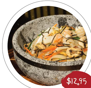
13. Stone Pot BiBimBap (Vegetarian option available upon request) 돌솥밥