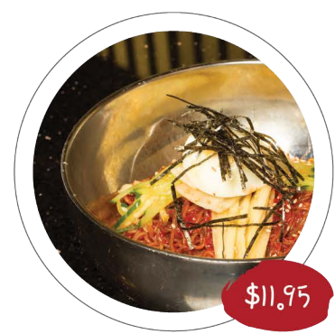
19. Cold Noodles (Served in broth) 냉면